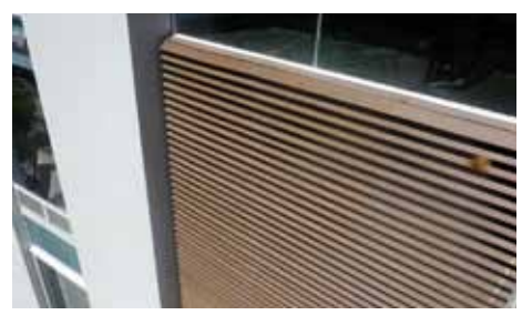
office building | Comaco

All its very exceptional properties make Resysta extremely resistant to weather influences like sun, rain, snow and ice, salt- and chlorine-water. Resysta does not swell, crack, splinter or rot. This we guarantee for 15 years.