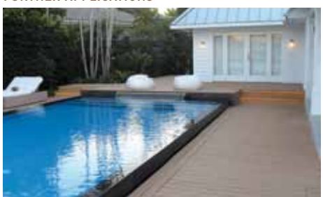
private villa | Key Biscane