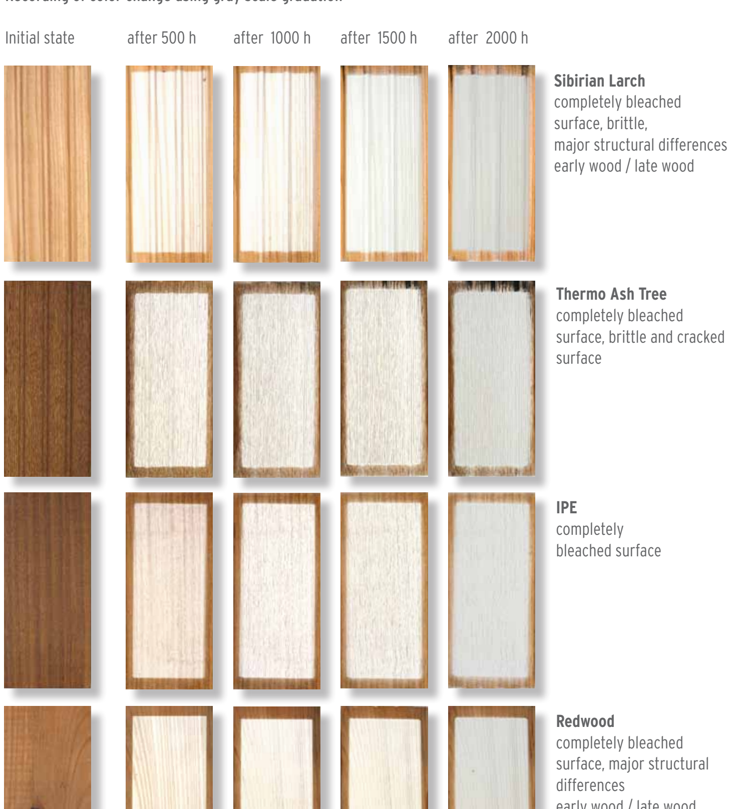
Recording of color change using gray scale gradation